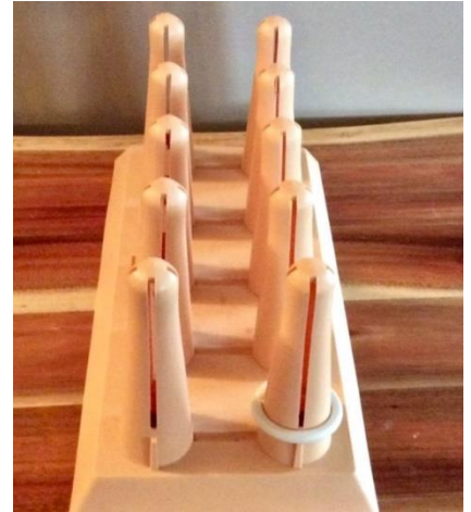
Image 3 - This Ring Toss game is made from a shower curtain ring and a drying rack for mittens and tuques.

Another option: Have players earn points or coupons based on how they do at each station. For example, you earn 5 coupons for getting all the cups down on one throw at Knockdown. If it takes two throws, you get three coupons. Whoever collects the most coupons in a certain amount of time is the winner. You could also have a prize booth and players can turn in their coupons for their choice of prize.