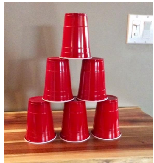
Image 1 - Knockdown