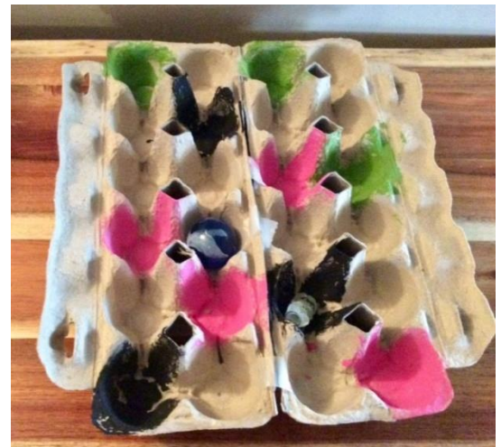
Image 4 - A basic egg carton toss game.